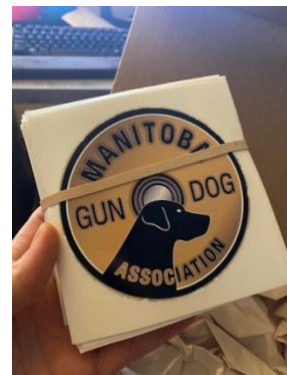
Available for purchase