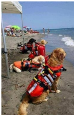
Lifeguards in Croatia