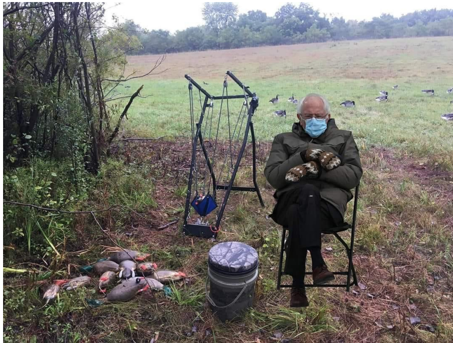
New club member ?????