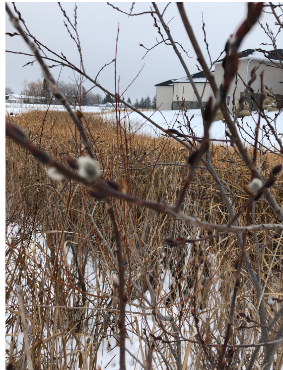
A couple of pictures Keith Merlin took of pussy willows in January.